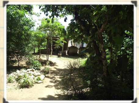
A typical Haitian home