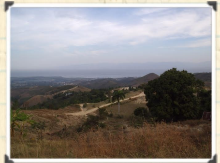
The Haitian countryside