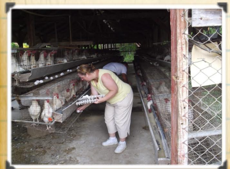
This chicken house supplies eggs to the mission, both for food and a source of income.